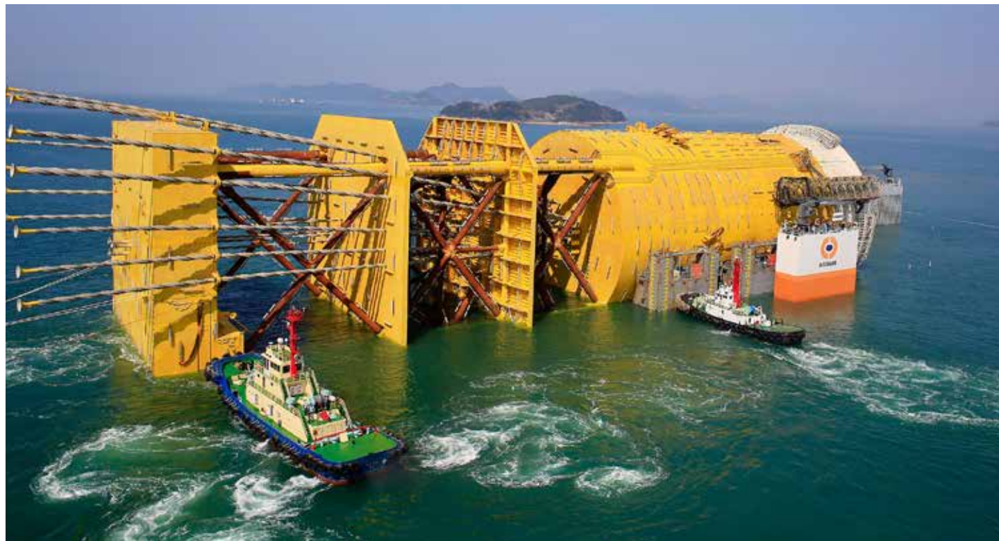
Aasta Hansteen is one of the newest fields to come on stream off Norway. It has been developed with a Spar platform, seen here being transported from the yard in South Korea to Norway.

It thereby has no quarters, helideck or lifeboats – not even a toilet. Personnel will go on board from a vessel fitted with a walkway.