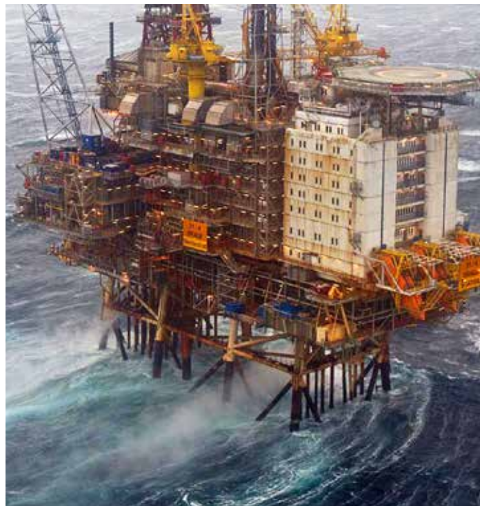
Brage in the North Sea is one of many Norwegian fields developed with a platform supported on a steel jacket.

The government and the scientists therefore had to accept that no necessary relationship existed between these two kinds of risk.