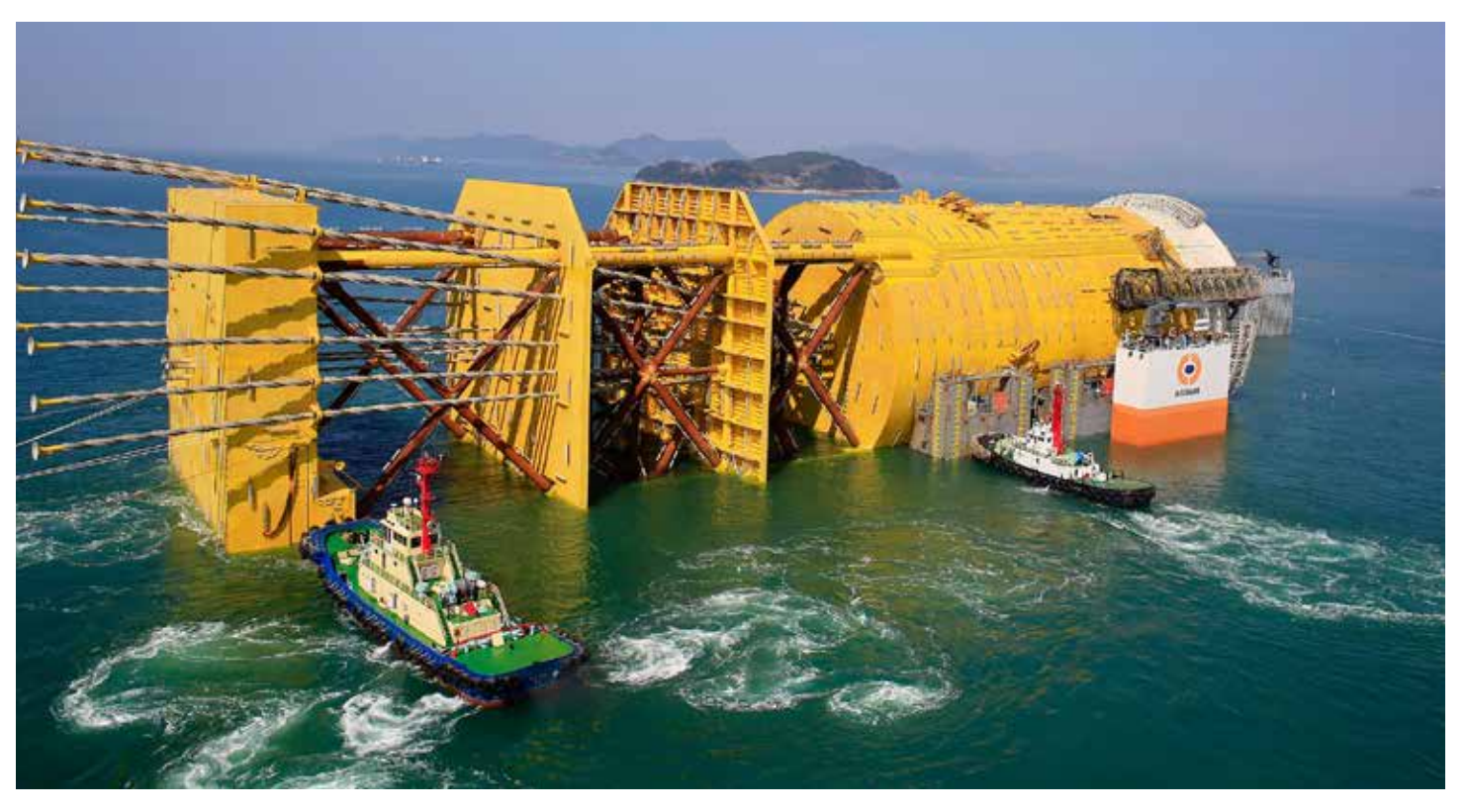
Aasta Hansteen is one of the newest fields to come on stream off Norway. It has been developed with a Spar platform, seen here being transported from the yard in South Korea to Norway.

Remotely operated from the Oseberg field centre, the H facility will only have people on board for one or two annual maintenance visits. It thereby has no quarters, helideck or lifeboats – not even a toilet. Personnel will go on board from a vessel fitted with a walkway.